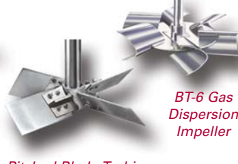
Pitched Blade Turbine