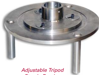
Adjustable Tripod Steady Bearing

has once again proven to be a leader with installation, operation, and maintenance friendly designs. Our unique "Adjustable Steady Bearing" makes quick work of bearing to shaft alignment ensuring long steady bearing component and gearbox/seal bearing life. Installation and maintenance personnel agree this is the best way to align a steady bearing on large equipment. Pad, bracket, tripod and sanitary steady bearings are available design options.