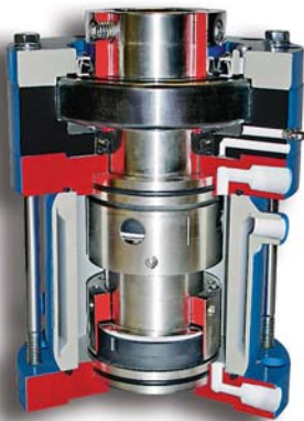
Double Mechanical Seal

For processes requiring the vessel to be sealed against the environment, Chemineer offers a variety of sealing options. For lower pressure applications, stuffing box seals are often used. Higher pressure and critical applications typically utilize double mechanical seals. The standard Chemineer double mechanical cartridge is completely bench pressure testable to ensure sealing performance before installation. Other mechanical seal